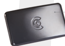
custo guard 3