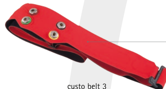
custo belt 3