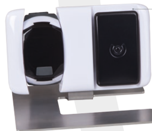
custo docking station